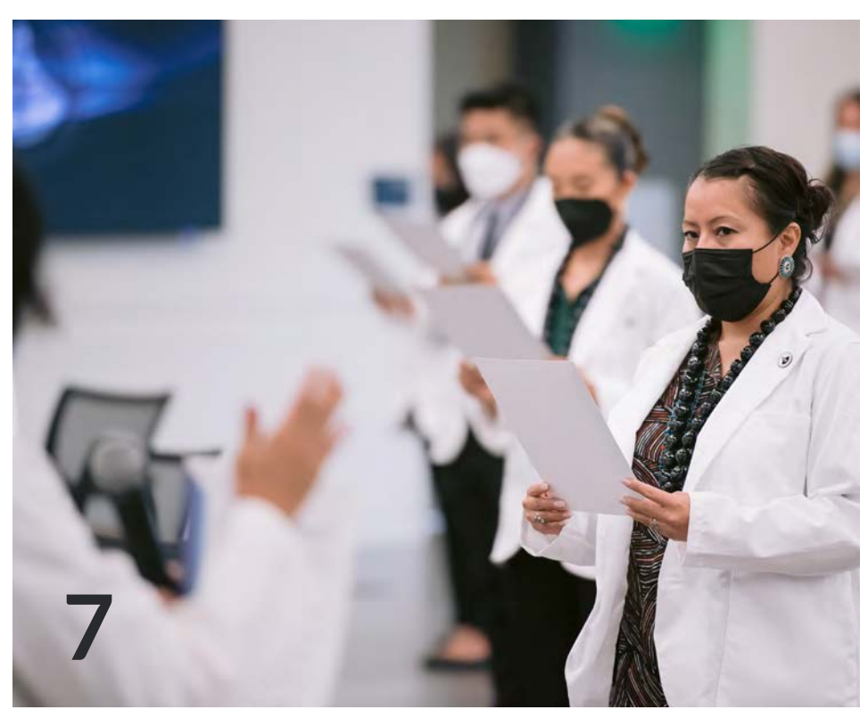
Students of the DKICP Class of 2025 recite the Oath of a Pharmacist at the White Coat Ceremony in October 2021.