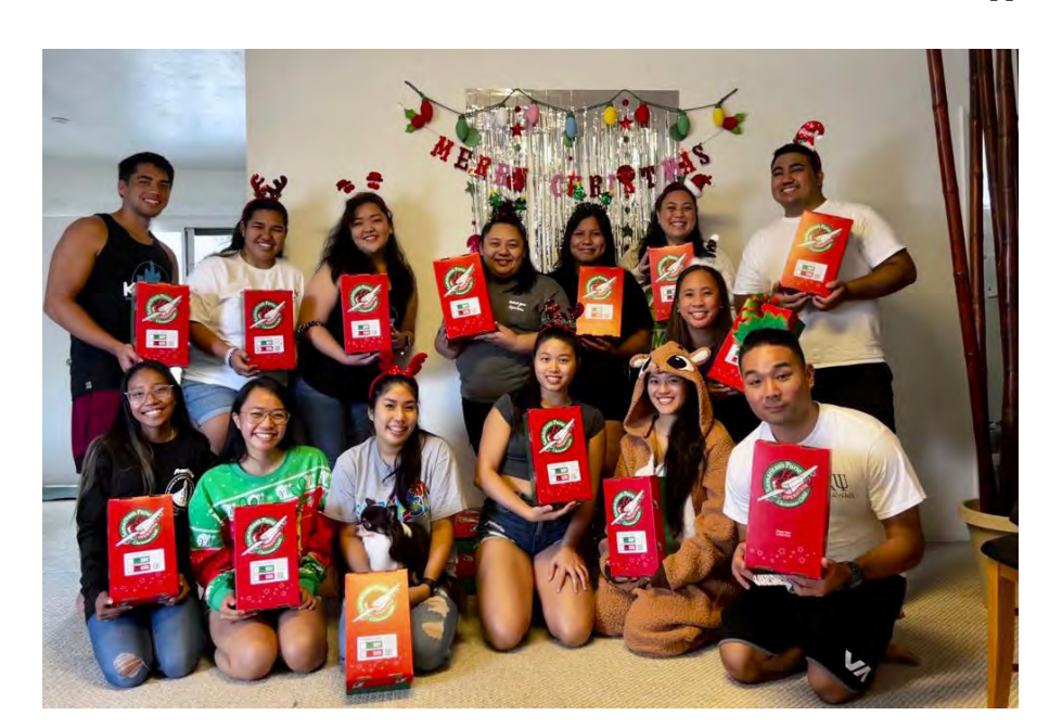
▲ Kappa Psi members collected 34 boxes containing toys and other items for Operation Christmas Child.

This philanthropy project was presented at our PacWest Province Fall Hybrid Assembly, hosted by Delta Tau in Las Vegas, Nev. Some current members attended virtually and some of our alumni and P4 brothers enjoyed themselves in-person, networking with other chapters. We hope to make this "new normal" the best that we can in 2022 as we continue to plan for the next Province Assembly that will be hosted and held by our Hawai'i chapter in Fall 2022.