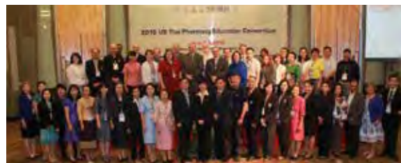
Attendees at the 2016 US-Thai Consortium for Pharmacy Education conference

Also pharmacy researchers from both U.S. and Thailand presented research from more than fifty papers from their research collaboration projects, practice and innovation collaborations and faculty and preceptor development programs.