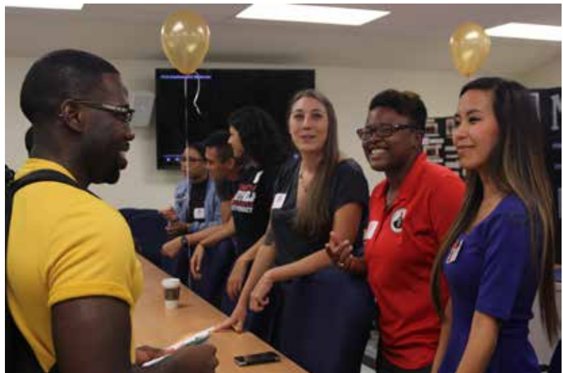
Classes of 2018 and 2019 Student Councils speak with incoming first-year student pharmacists about their positions.